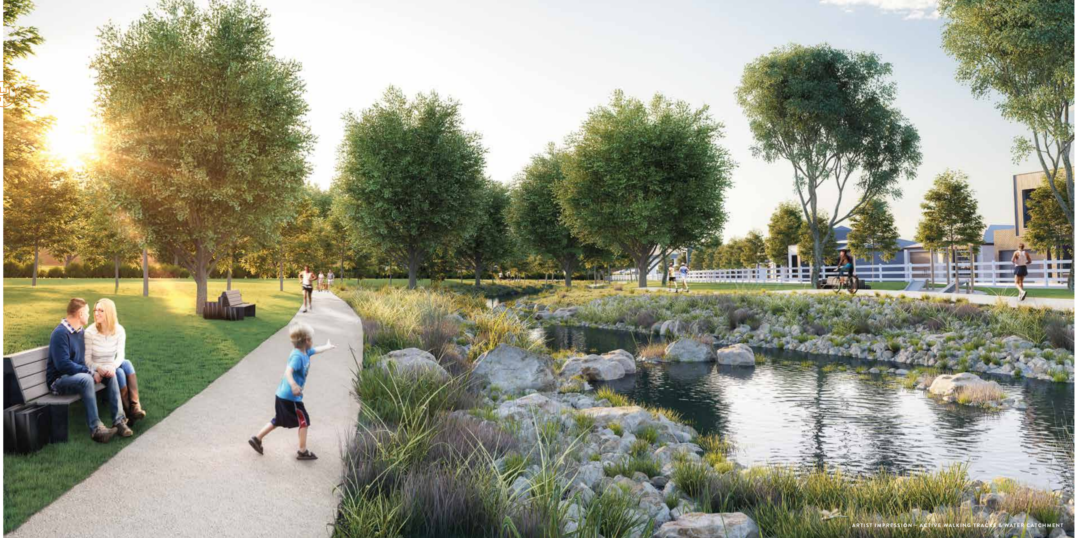
ARTIST IMPRESSION – ACTIVE WALKING TRACKS & WATER CATCHMENT