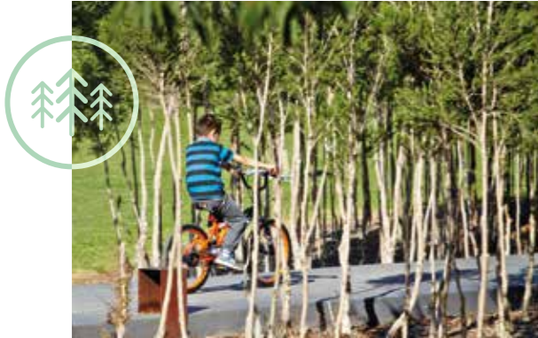
01. Royal Botanic Gardens, Cranbourne

Whilst Hartleigh will eventually place you in the heart of Clyde, there is also a wealth of existing amenity readily available in the neighbouring suburbs of Cranbourne and Berwick.