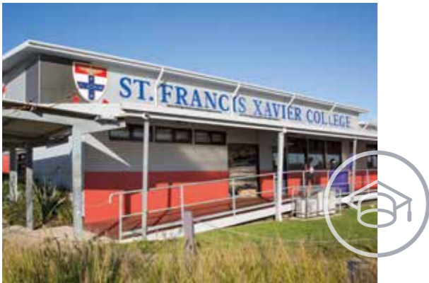
22. St Francis Xavier