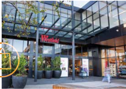
07. Westfield Fountain Gate Shopping Centre