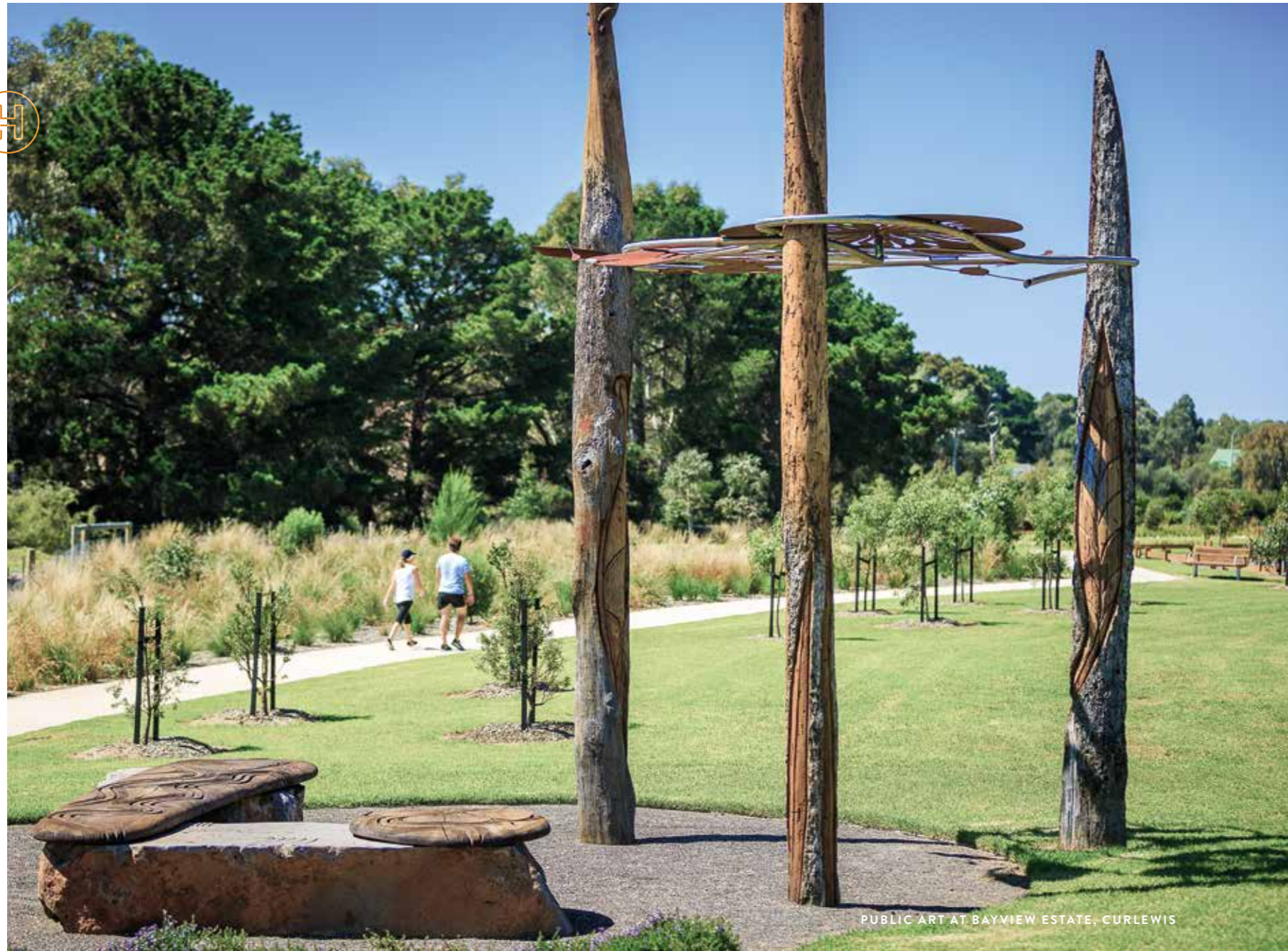
PUBLIC ART AT BAYVIEW ESTATE, CURLEWIS