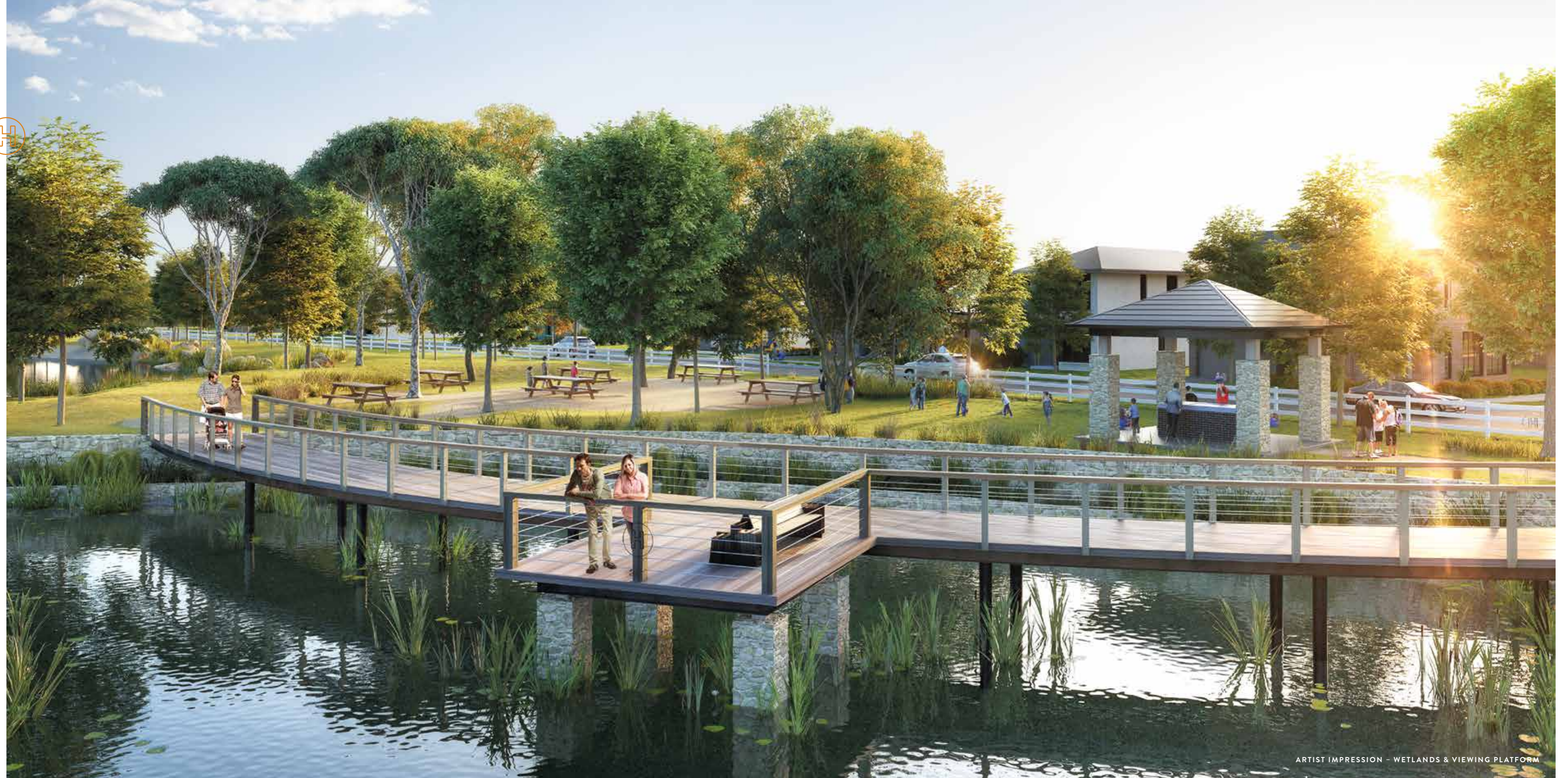
ARTIST IMPRESSION - WETLANDS & VIEWING PLATFORM