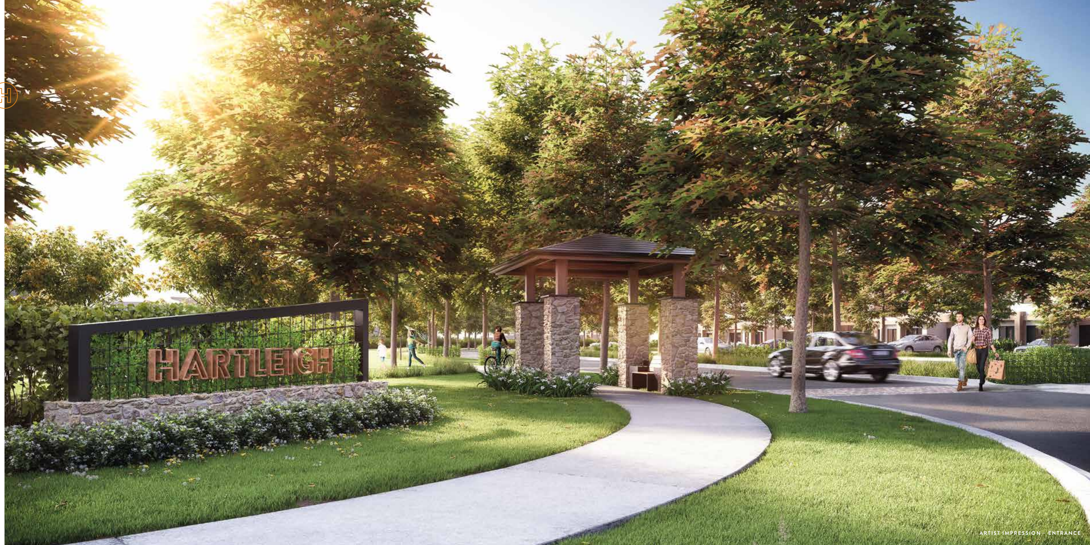
ARTIST IMPRESSION - ENTRANCE