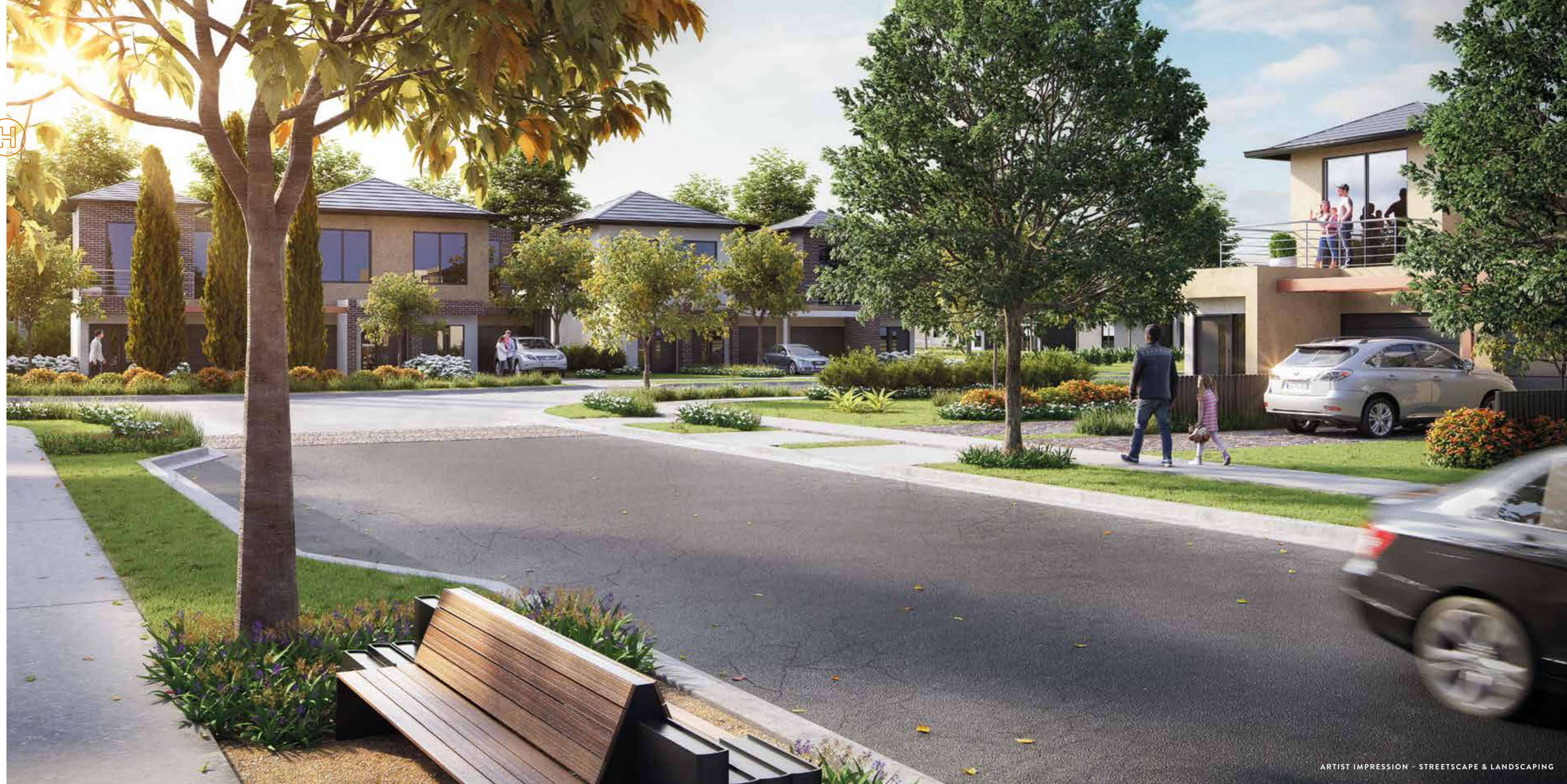
ARTIST IMPRESSION - STREETScape & LANDSCAPING