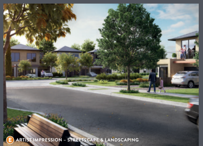
E ARTIST IMPRESSION - STREETSCAPE & LANDSCAPING