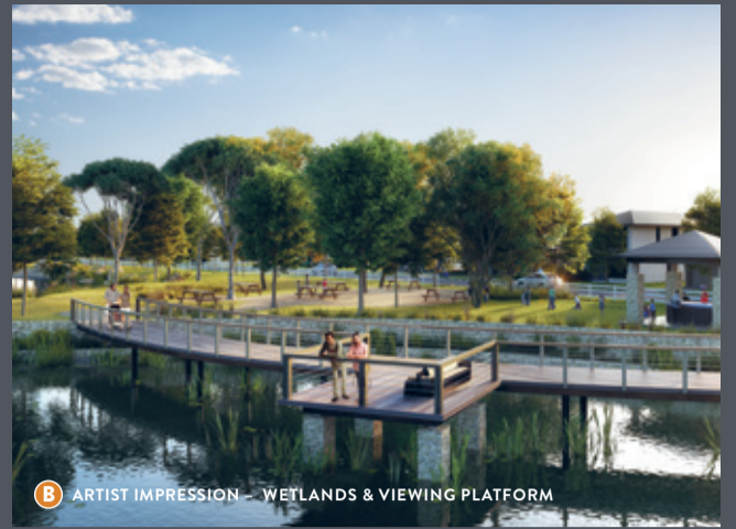
B ARTIST IMPRESSION - WETLANDS & VIEWING PLATFORM