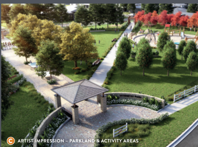
C ARTIST IMPRESSION - PARKLAND & ACTIVITY AREAS