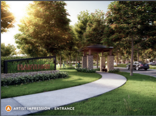
A ARTIST IMPRESSION - ENTRANCE