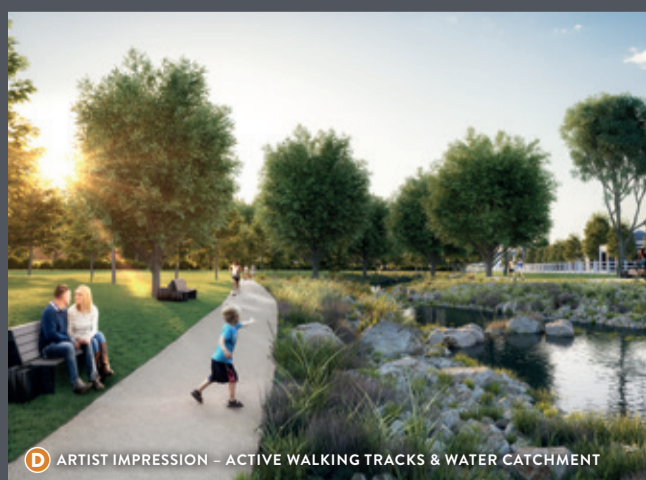
D ARTIST IMPRESSION - ACTIVE WALKING TRACKS & WATER CATCHMENT