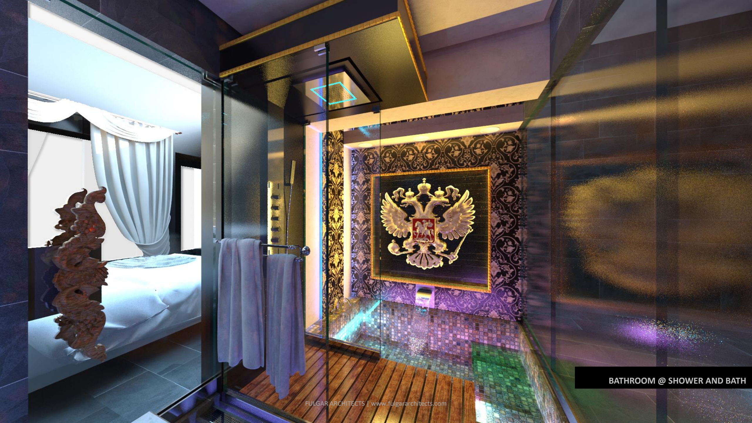
BATHROOM @ SHOWER AND BATH