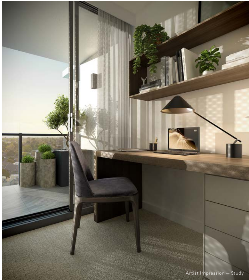
Artist Impression — Study

— Selected residences feature a handy nook for a home office or university study.