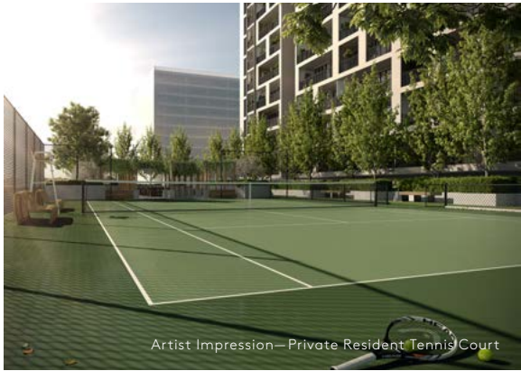
Artist Impression—Private Resident Tennis Court