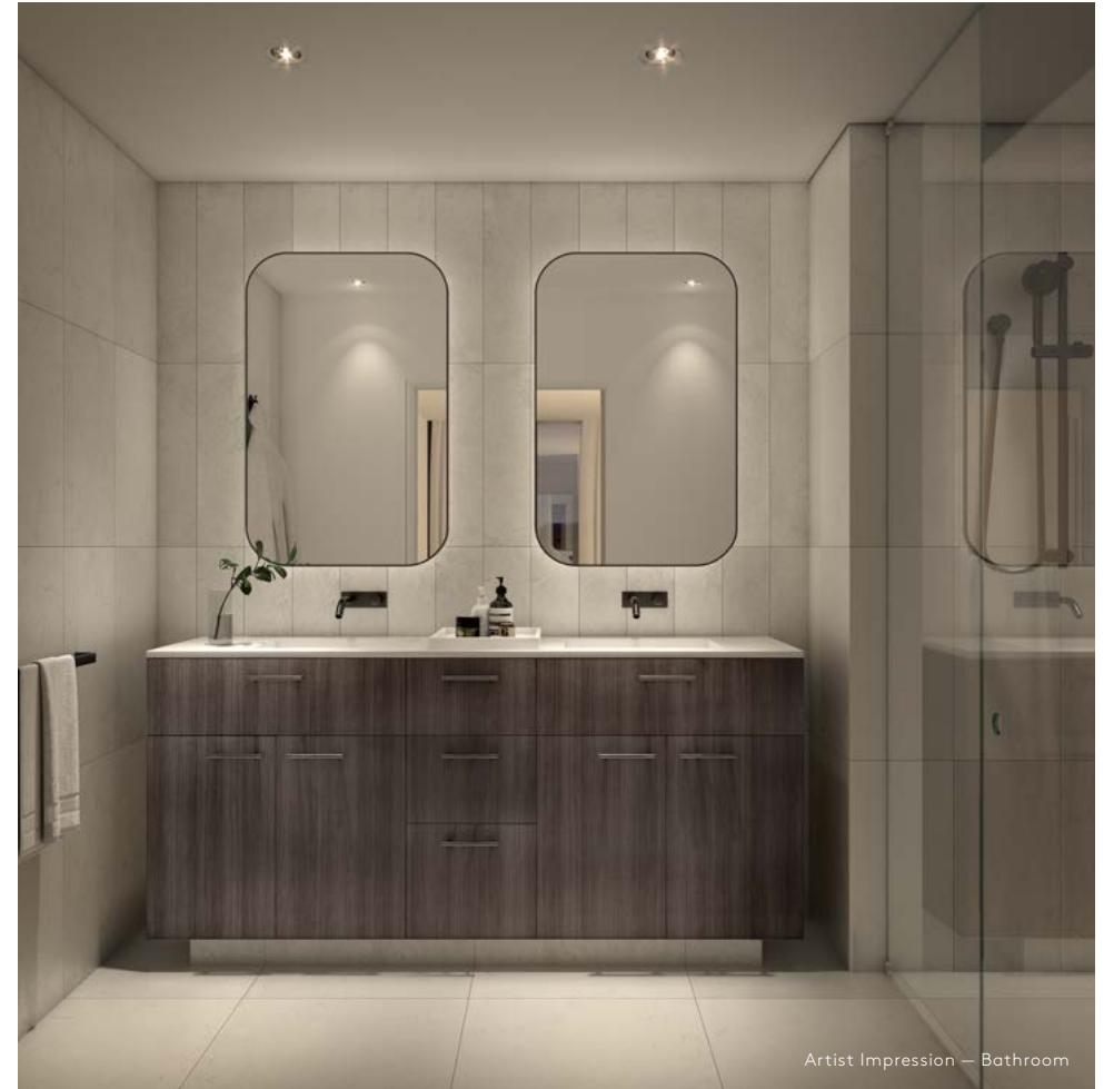
Artist Impression — Bathroom

— Exquisite finishes complete the generous bathrooms, embellished with modern black tapware and accessories.