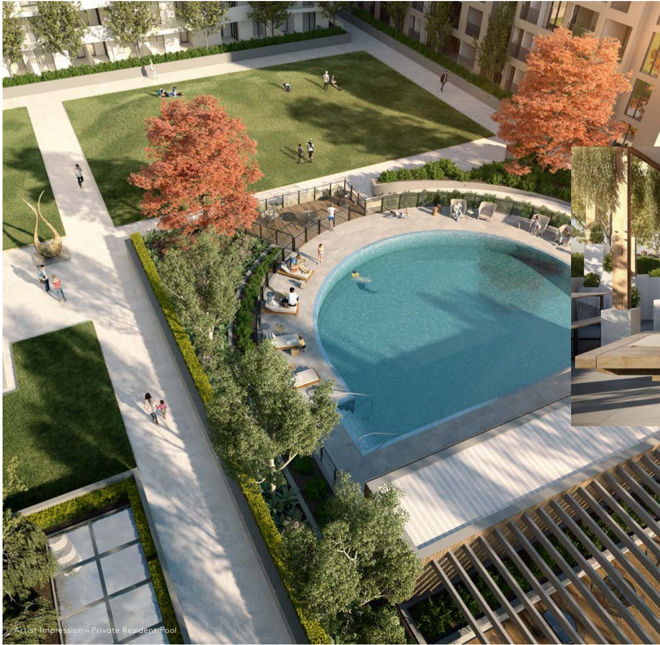
Artist Impression—Private Resident Pool

The sparkling waters of the swimming pool and landscaped lawn areas beckon on sunny days.