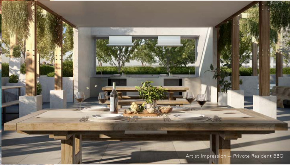
Artist Impression—Private Resident BBQ

The sparkling waters of the swimming pool and landscaped lawn areas beckon on sunny days.