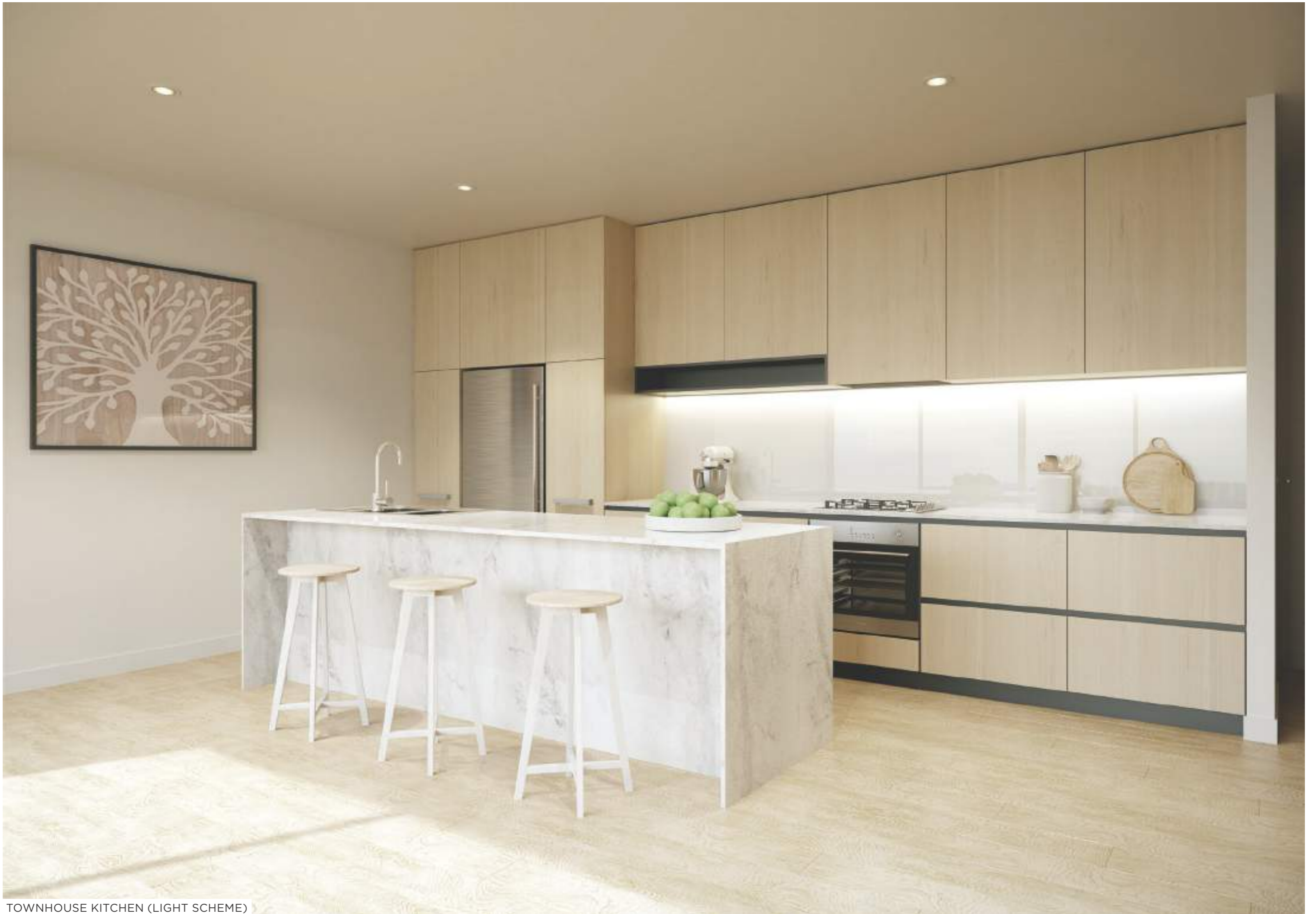
TOWNHOUSE KITCHEN (LIGHT SCHEME)