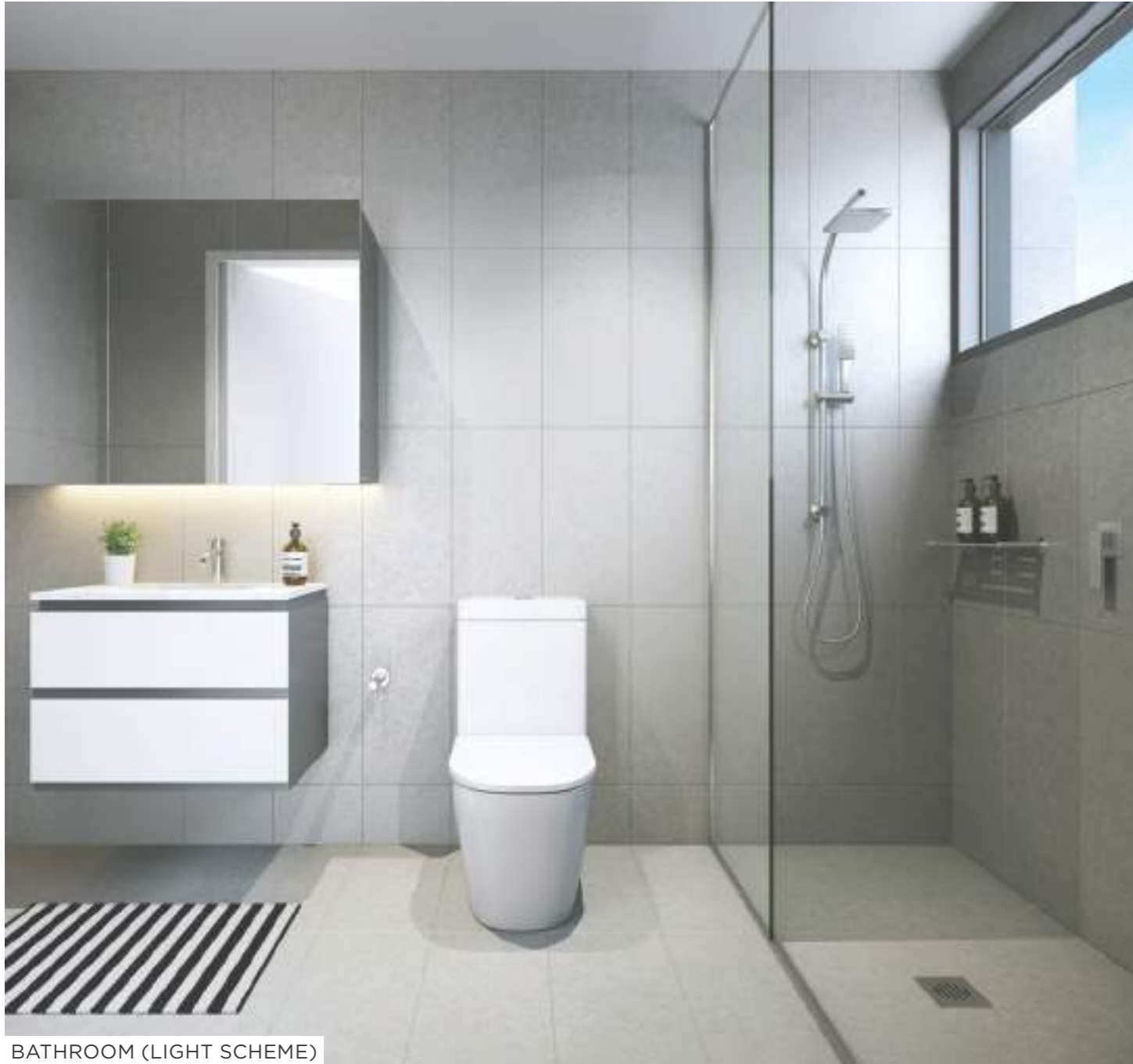
BATHROOM (LIGHT SCHEME)