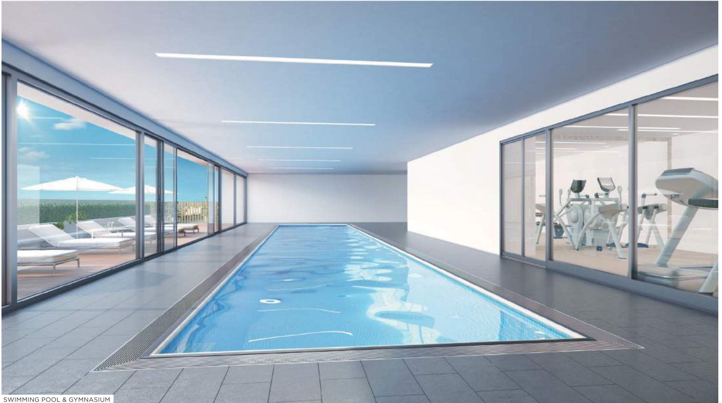
SWIMMING POOL & GYMNASIUM