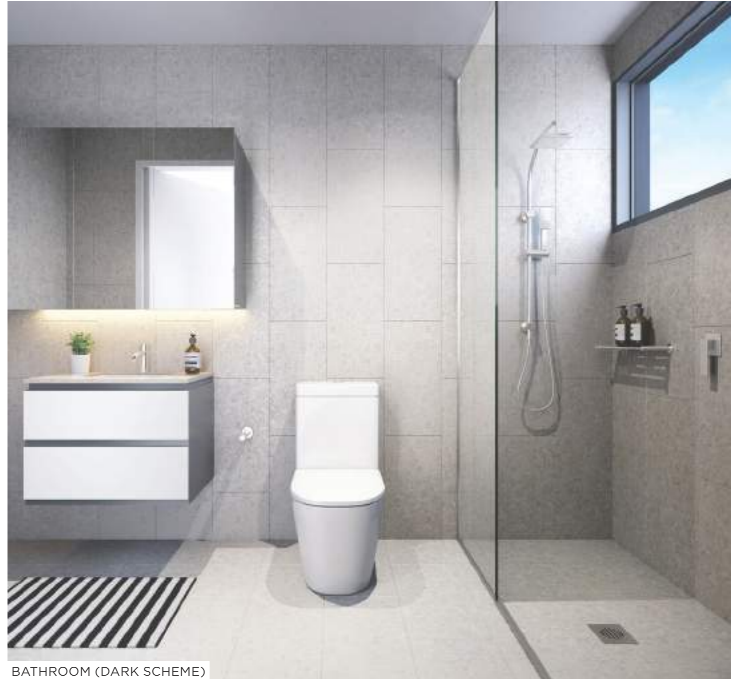
BATHROOM (DARK SCHEME)