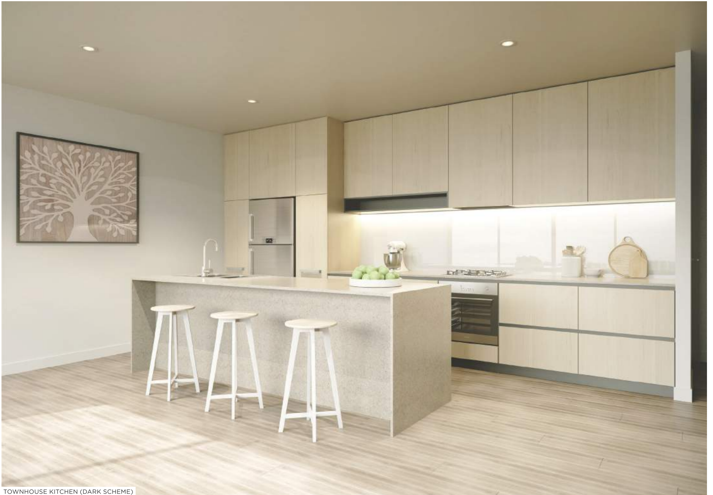
TOWNHOUSE KITCHEN (DARK SCHEME)