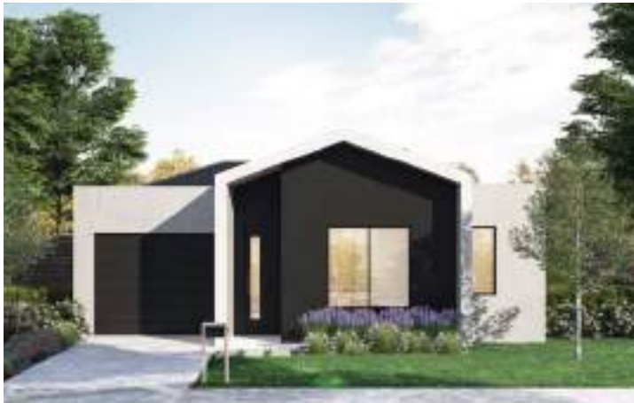
Jessica. 🏠 3 🚗 2 🚗 2