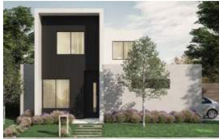
Diana. 🏠 4 🚗 2.5 🚗 2