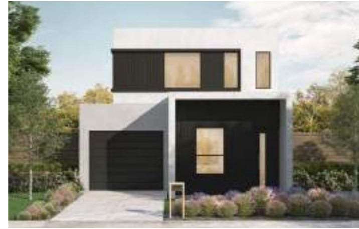
Alanna. 🏠 3 🚗 2.5 📖 1 🚗 2