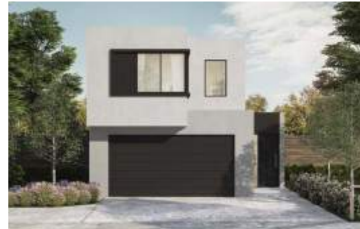
Vanessa. 🏠 4 🚗 2 🚗 2