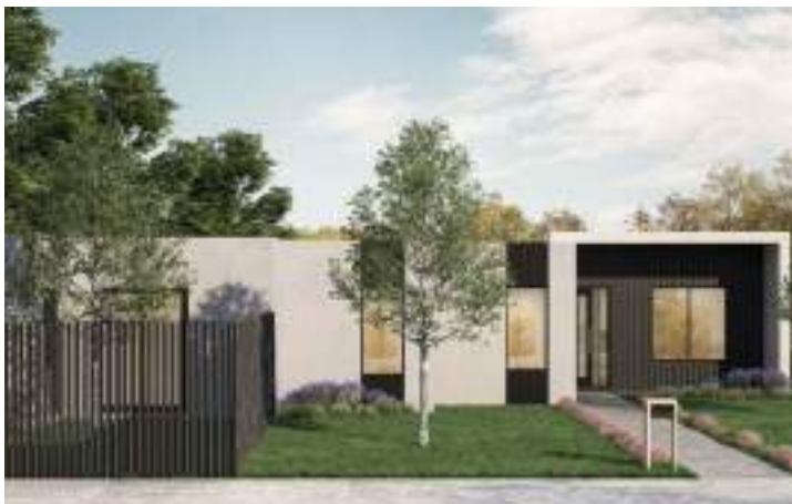
Natalie. 🏠 3 🚗 2.5 🚗 2