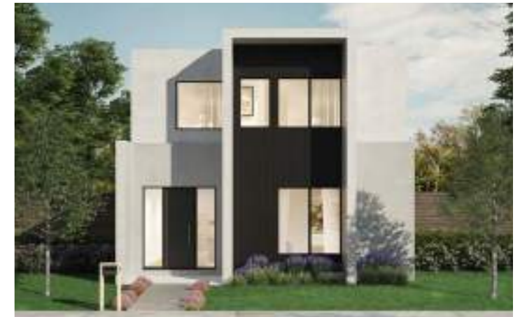
Jaida. 🏠 4 🚗 2.5 🚗 2