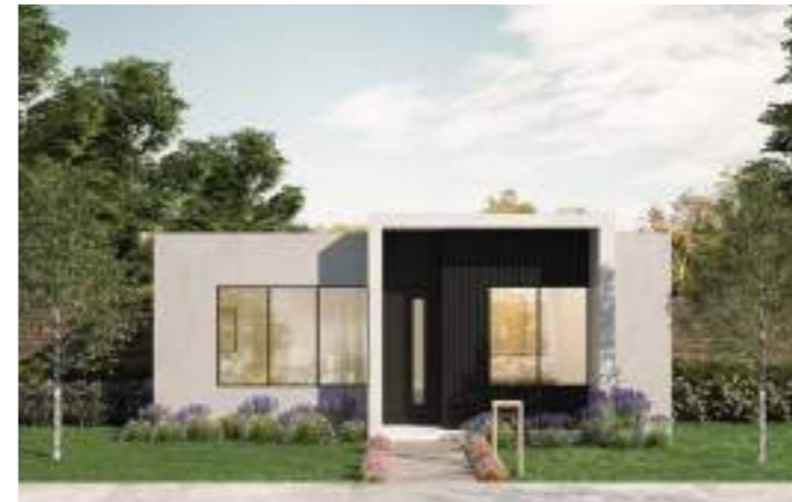
Tess. 🏠 4 🚗 2.5 🚗 2