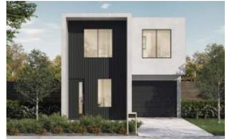
Bianca. 🏠 3 🚗 2.5 📖 1 🚗 2