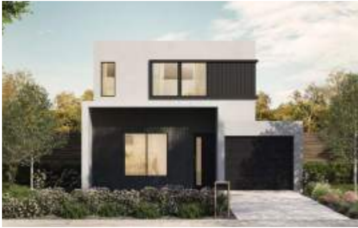
Simone. 🏠 3 🚗 2.5 📖 1 🚗 2