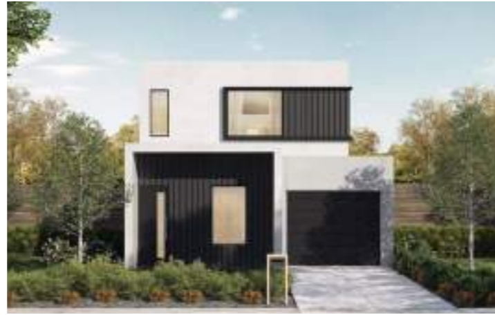
Lara. 🏠 3 🚗 2.5 📖 1 🚗 2