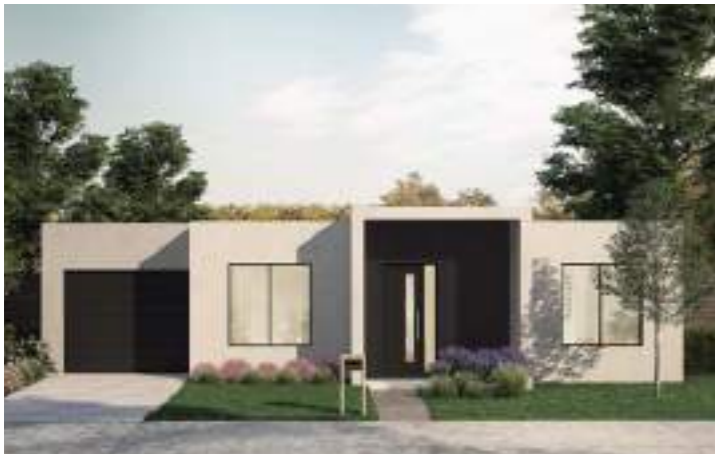
Peiyee. 🏠 4 🚗 2 🚗 2