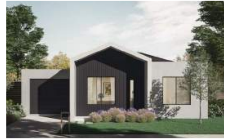
Carrmen. 🏠 3 🚗 2 📖 1 🚗 2