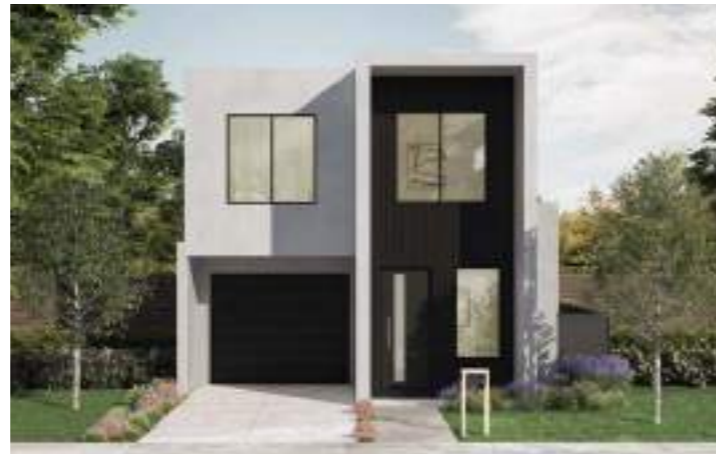
Jennifer. 🏠 3 🚗 2.5 📖 1 🚗 2